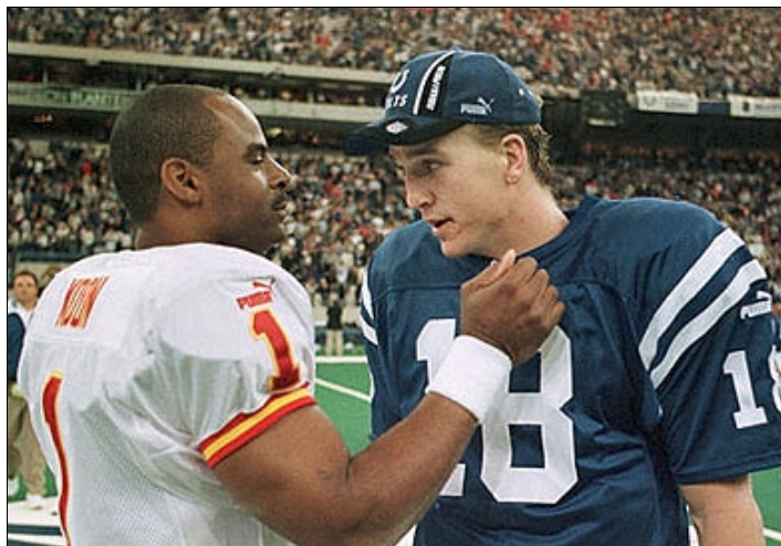
The Barons need a big day from Peyton Manning against the Lancers on Sunday. Pictured, Manning gets some advice from Warren Moon after the Colts beat the Chiefs last week.